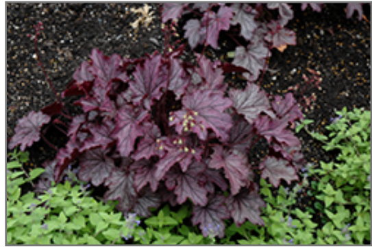
Spellbound Coral Bells