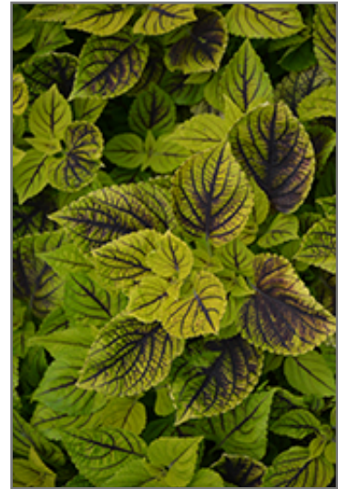
Gays Delight Coleus foliage