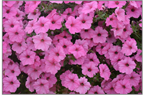
Supertunia Vista Bubblegum Petunia flowers