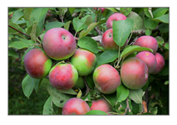
Macintosh Apple fruit

Macintosh Apple features showy clusters of lightly-scented white flowers with shell pink overtones along the branches in mid spring, which emerge from distinctive pink flower buds. It has forest green deciduous foliage. The pointy leaves turn yellow in fall. The fruits are showy red apples with hints of light green, which are carried in abundance in early fall. The fruit can be messy if allowed to drop on the lawn or walkways, and may require occasional clean-up.