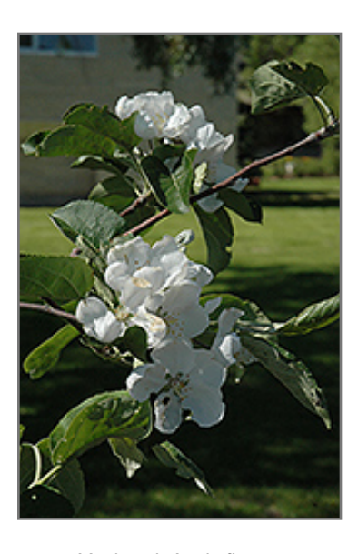
Macintosh Apple flowers