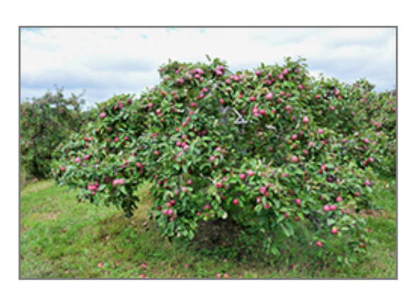
Macintosh Apple fruit